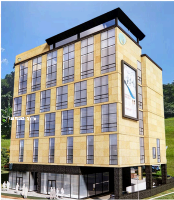
Stem Cell Medical Center (5 Story)