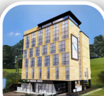
Luisa Stemcell Medical Center