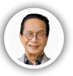
ATTY. SALVADOR PANELO LAWYER FORMER PRESIDENT'S LEGAL COUNSEL AND SPOKESPERSON